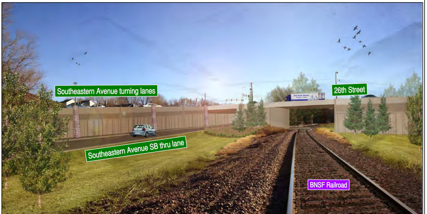
Proposed View Looking Southeast