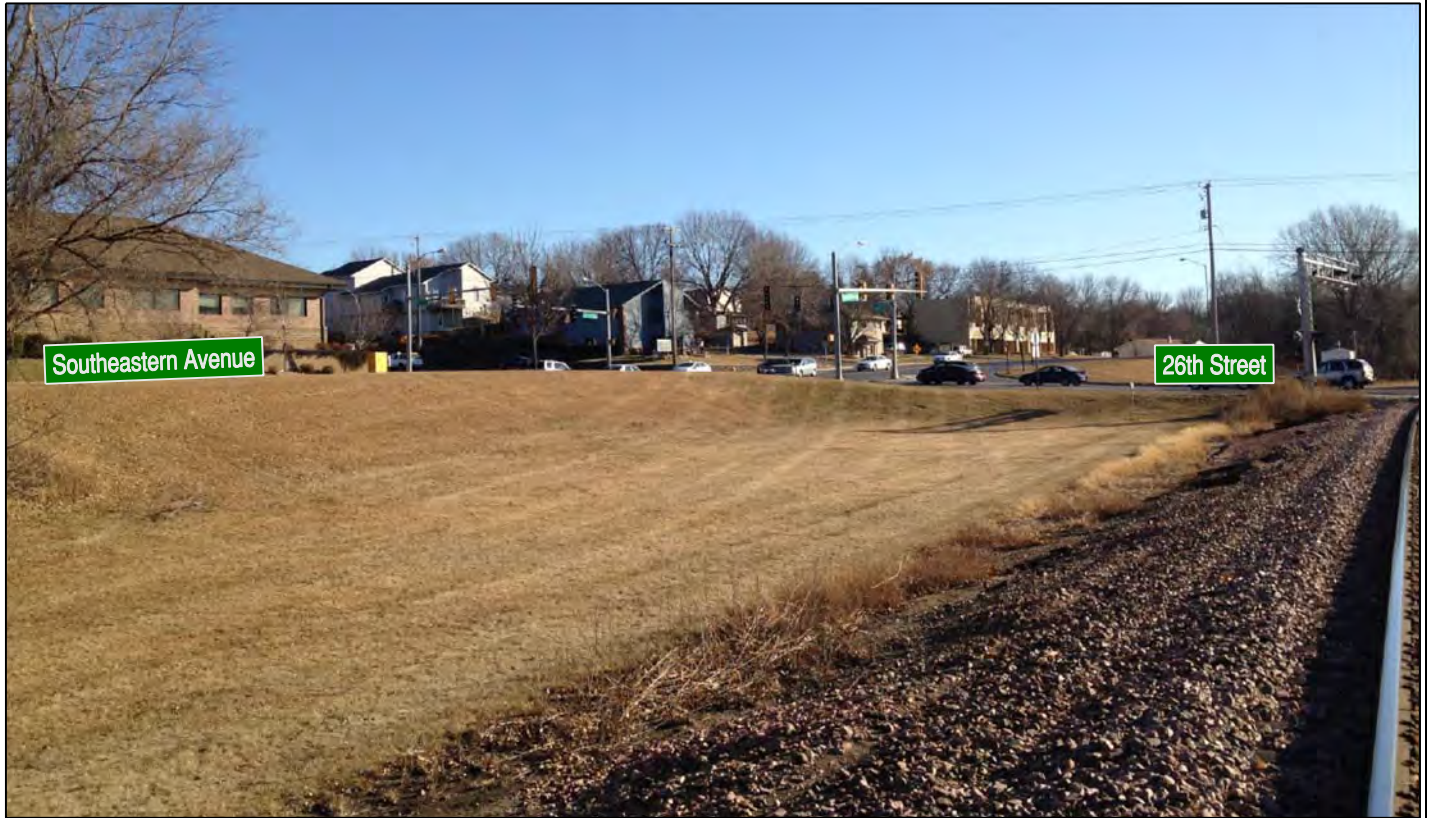
Existing View Looking Southeast