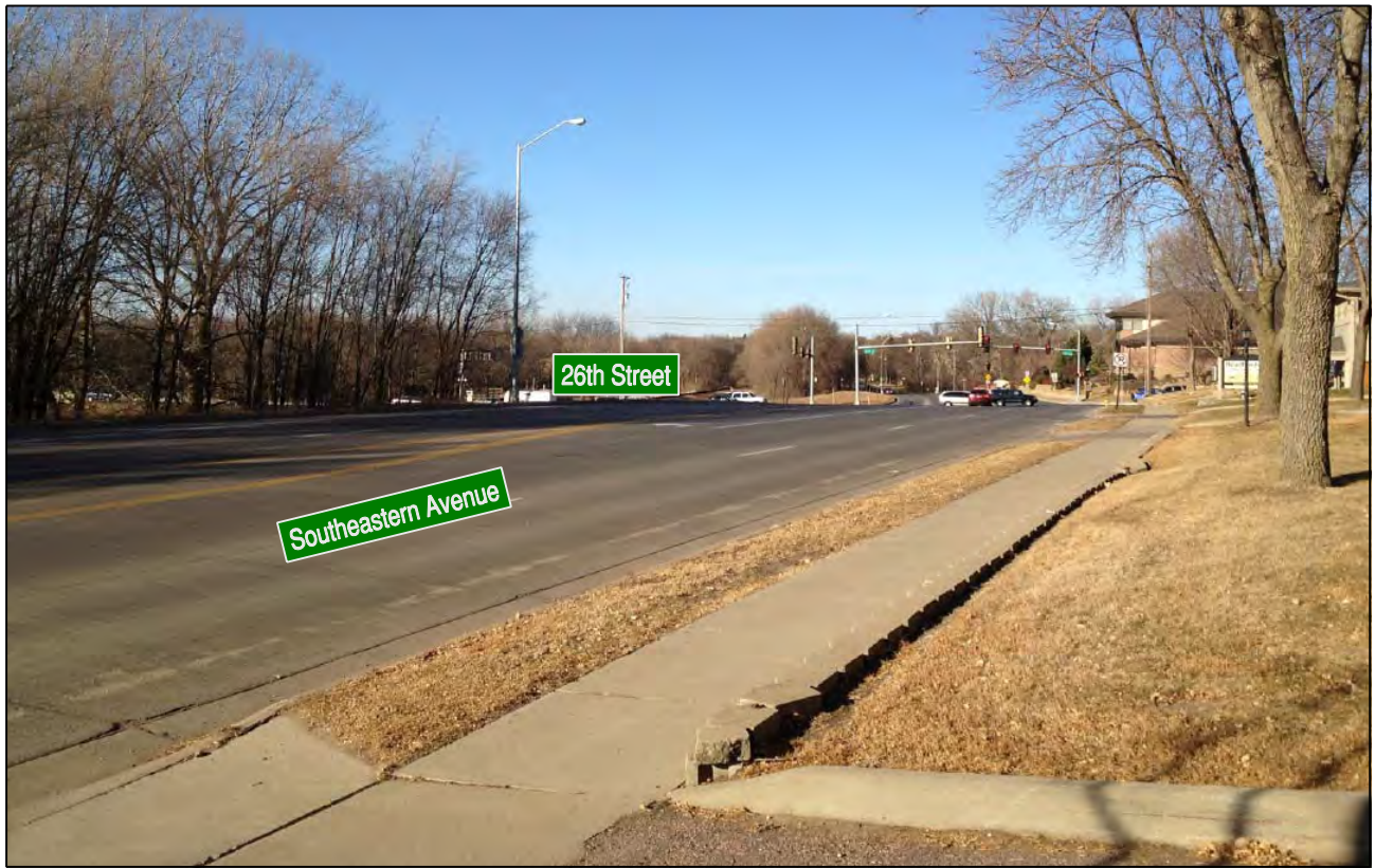
Existing View Looking Northwest