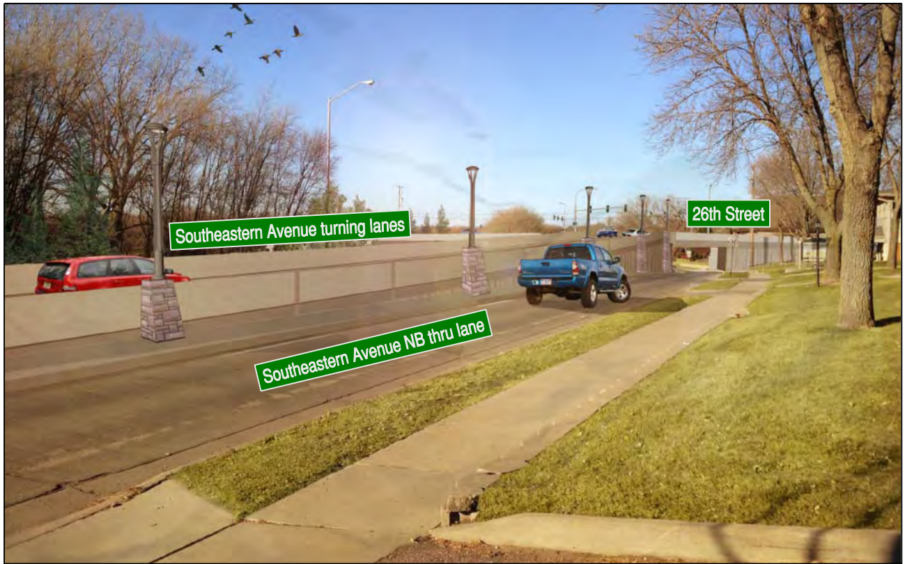
Proposed View Looking Northwest