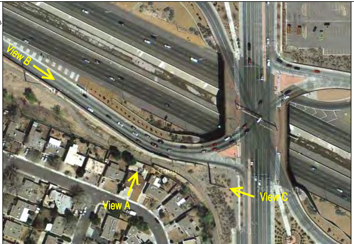
I-40 / Louisiana Blvd Interchange in Albuquerque, NM